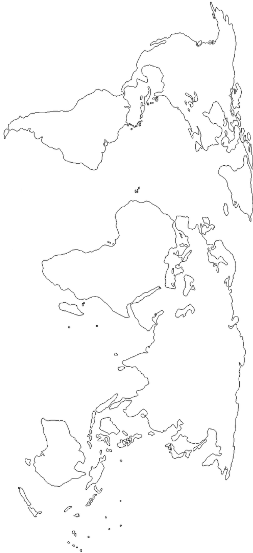
Map 1: Columbian Exchange